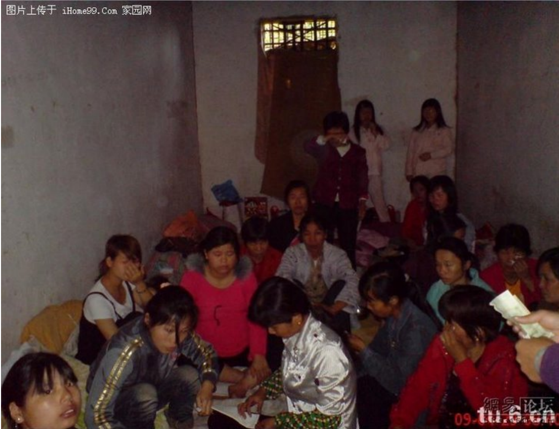
Poor rural women are hidden by the officials in this so-called “harmonious flourishing age.” No domestic media dares report the events that violate women’s legal interests.