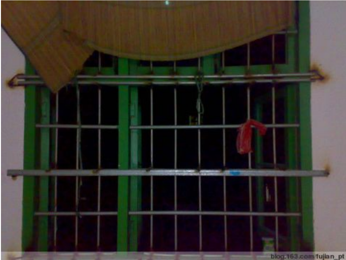
Bars of the cells for detention in the Family Planning office of Yuanzhuang Town, Xianyou County.

Detained relatives of villagers who have given birth to an extra child, or who failed to come back to take the pregnancy check. Twenty or thirty of them sleep on the floor [in the Family Planning jail cell] like this.