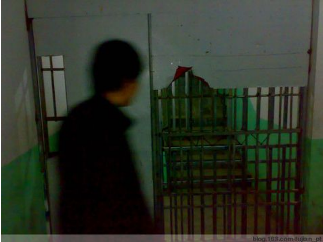
Door of the cells for detention in the Family Planning office of Yuanzhuang town, Xianyou county.

money is submitted. The cells on the third floor of the Family Planning Office are even overstaffed [overcrowded] at busy periods and some captives have to sleep in the corridor. Usually about thirty elderly are detained there the entire year. Wealthy people can pay the fine and leave; but for the poor who have to stay there, the government does not pay for their food. They would starve if their family members or neighbors did not send them food. Their farmlands are left uncultivated as well. If the victim has any complaint, the county officials beat him and exclaim: “report me if you remain unconvinced.” The officials all shield one another.