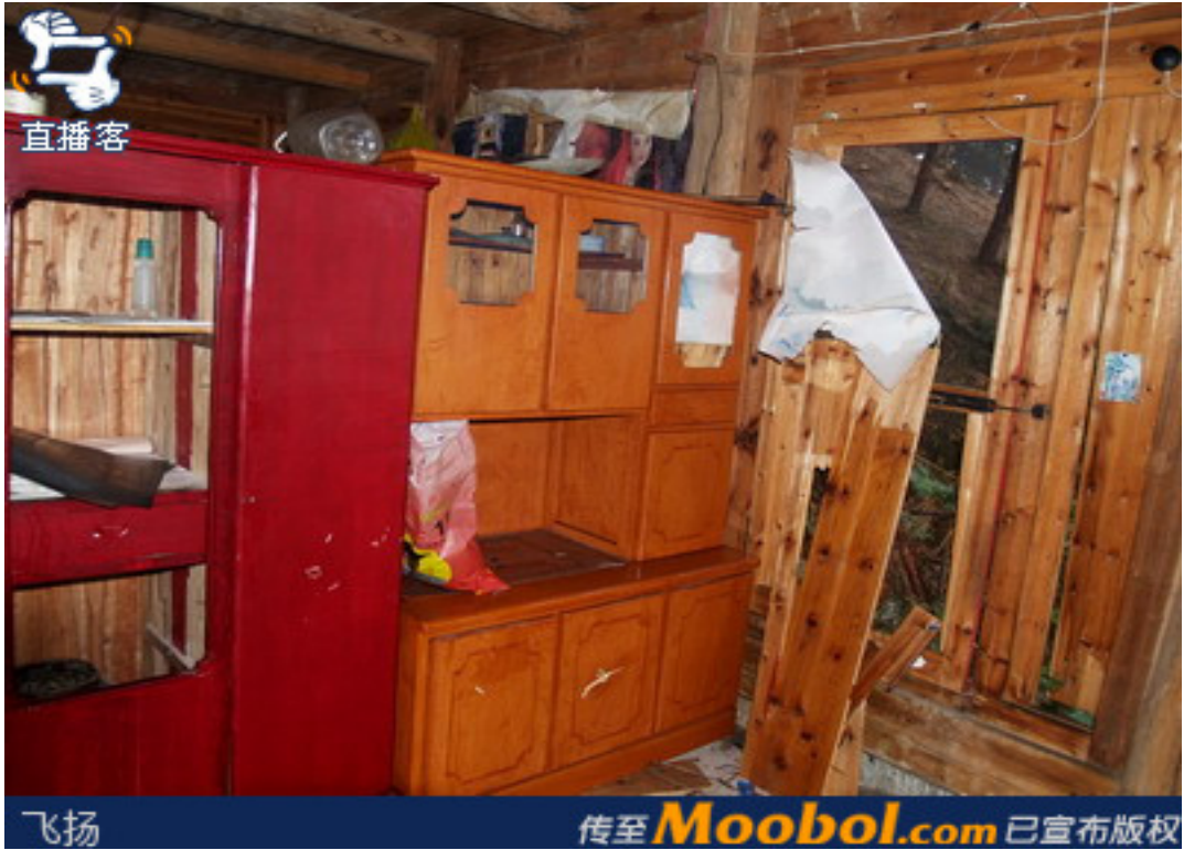
Furniture smashed by the Family Planning Officials.