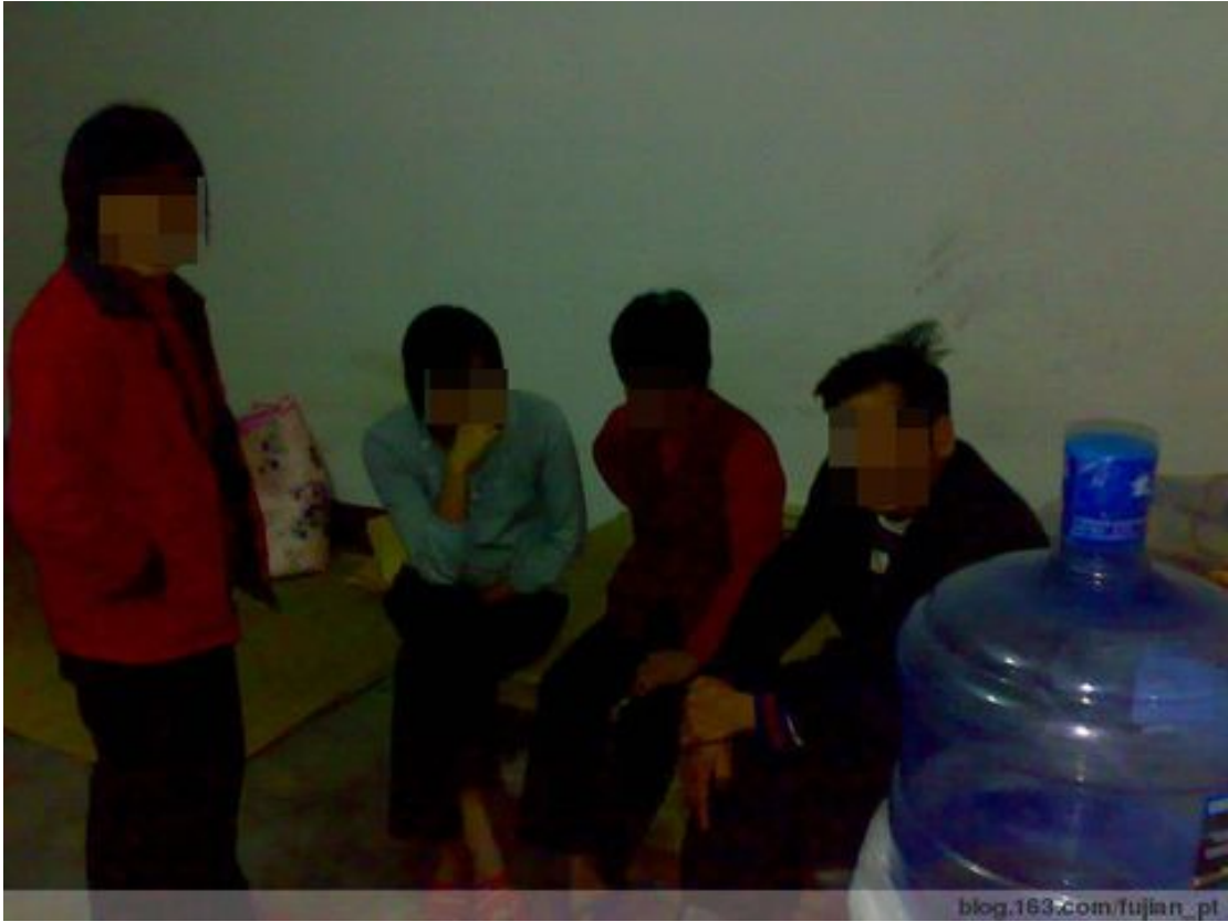
These are parents of the villagers who gave birth to an extra child or failed to return to take the pregnancy check [detained in the Family Planning Office jail cell].